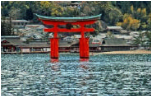
"Miyajima", World Heritage

Including: Miyajima, a World Heritage site, with beautiful shrines floating on the sea, and Kintai-kyo in Iwakuni City, a bridge famous for its five gracefully arched spans, and one of the three unique bridges in Japan.