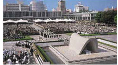
Peace Memorial Ceremony, in front of the Peace Memorial Museum

Largest event with around 40,000 participants. The Mayor will read the Peace Declaration. Before daybreak, a solemn atmosphere fills the park, where the memorial cenotaph is visited by the families and relatives of the atomic bomb victims.