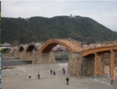
"Kintai-kyo", One of the Three Unique Bridges in Japan